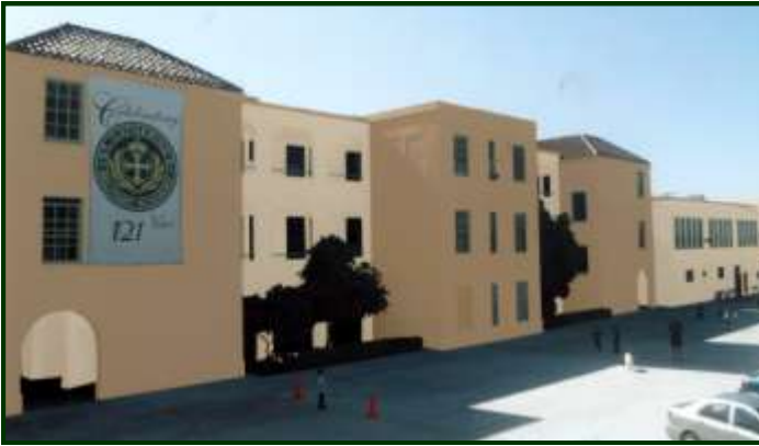
A computer rendition of St. Catherine's new paint job. Stay tuned for pictures of our renovations or stop by to see them for yourself in the new year!

The J.F. Shea Foundation will help SCA with several urgent renovations on our 121-year-old campus. The Foundation will replace our 90-year-old campus fence and professionally repaint our entire school exterior. These projects will begin during the Christmas break and continue into the new year.