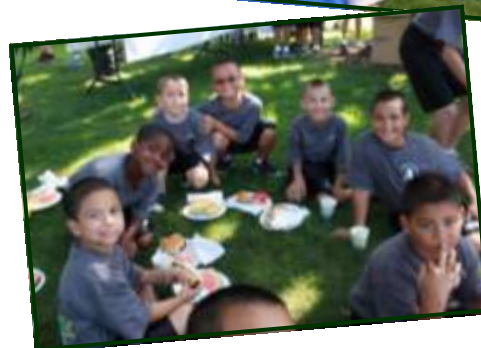
Alpha Company enjoys lunch and a well-deserved break.