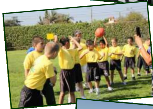
Charlie Company races to complete one of the company competitions.