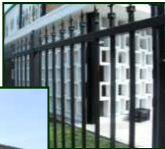
Right: Our new fence is 6ft tall with a decorative pointed top for added security.

Thanks to the generosity of the J.F. Shea Foundation and our SCA family, St. Catherine's received $143,000 for campus renovations over the past few months. Updates include the repainting of our entire school exterior and the replacement of our campus fence. Feel free to stop in to see our new improvements in person!