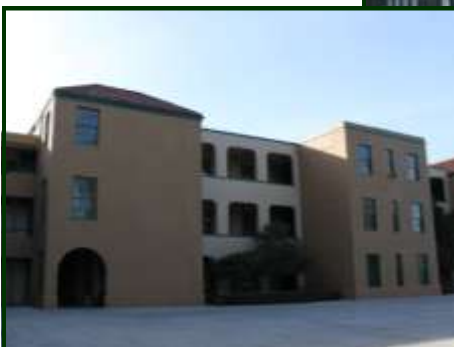
Left: Our new two-toned paint job really makes the buildings pop!