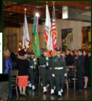
Right: The cadet Color Guard and Honor Guard presented a special tribute to the Armed Forces.