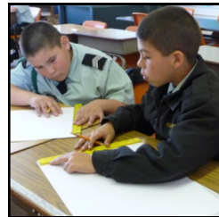
Fifth graders at St. Catherine's work on a math project. Research shows that boys learn best by actively experiencing knowledge.

St. Catherine's Academy is now enrolling day and boarding students for the To find out more about their unique all boys' program, visit their website at www.Academy.org .